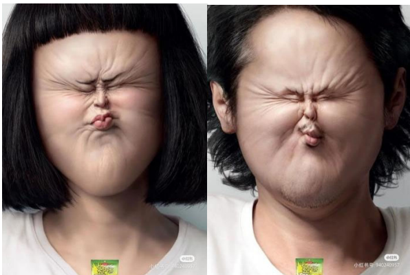
Figure 2.2. Poster design with exaggerated deformation techniques

The composition of the film and television drama "Psychological Crime" belongs to the left and right composition, using an obvious fault wind effect to highlight the personality, and the overall picture is dark, which is suitable for the theme of the movie. The graphics are the side faces of the two protagonists, which are cut from the center of the picture, but the junction is not completely integrated, there is an up and down position offset, and the picture is more layered and pictured. The text has a glitch effect to fit the theme. The main font is enlarged in the triangle of the picture, and the attached small print part is in the lower left corner, and the picture looks more balanced and perfect. The overall picture of the movie "Fanghua" looks concise but rich, with a picture, a title, a few lines of small print, and the main colors are black, white, gray and light green, which is concise and to the point. The font color is light green, which is the same color as the right shoe and fits the main body. The word "Hua" is replaced, and the image of a girl dancing replaces the following strokes, which not only highlights the film and television content, but also looks very creative and beautiful.