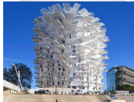
Figure 3.4. Surrealist architectural design

Contemporary Japanese architecture has always had a place in the architectural world, and these environments have given rise to a growing number of architecturally passionate designers who are promoting the ideas of Japanese architecture to the world. Sou Fujimoto is one of the brightest of them. In Sou Fujimoto's eyes, the relationship between nature, architecture, and people is an eternal issue. He has been following the development of the relationship between the three. Past works that explore a primitive and ambiguous relationship open the door to the future. If you open this door, you can live in the kind of environment that Fujimoto has created, where people and architecture live in harmony, and where architecture and nature have no sense of border. This utopian construction is reflected in the lightweight walls and enclosure forms, thinner and thinner walls, fewer and fewer enclosures, and more and more changing spatial forms.