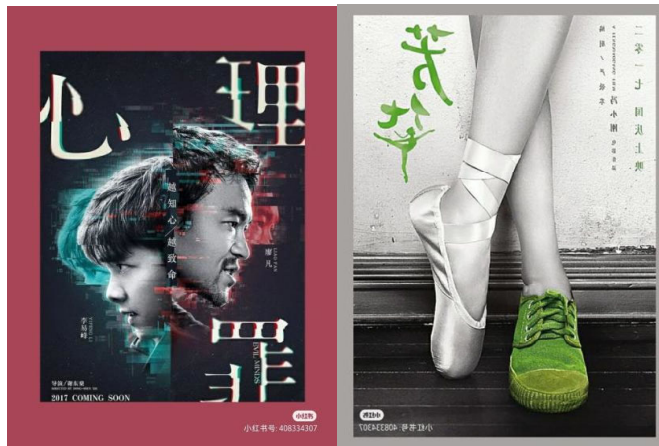
Figure 2.1. Poster design by reorganizing and deconstructing techniques

The composition of the film and television drama "Psychological Crime" belongs to the left and right composition, using an obvious fault wind effect to highlight the personality, and the overall picture is dark, which is suitable for the theme of the movie. The graphics are the side faces of the two protagonists, which are cut from the center of the picture, but the junction is not completely integrated, there is an up and down position offset, and the picture is more layered and pictured. The text has a glitch effect to fit the theme. The main font is enlarged in the triangle of the picture, and the attached small print part is in the lower left corner, and the picture looks more balanced and perfect. The overall picture of the movie "Fanghua" looks concise but rich, with a picture, a title, a few lines of small print, and the main colors are black, white, gray and light green, which is concise and to the point. The font color is light green, which is the same color as the right shoe and fits the main body. The word "Hua" is replaced, and the image of a girl dancing replaces the following strokes, which not only highlights the film and television content, but also looks very creative and beautiful.