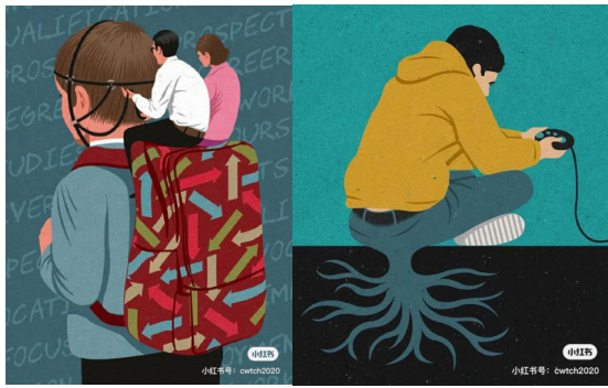
Figure 3.2. Surreal illustration design

This group of illustrations is designed to use our behavior in life to show common phenomena in society, young people are addicted to games and other entertainment activities, children's thoughts are not controlled by themselves, and your simple main characters convey a strong sense of irony, most of them use a central composition, although compared with other compositions, more rigid, and the application of elements is relatively rare, but it contains a huge picture impact, highlighting the theme, and the layers are clear. While the picture adopts a gloomy cold gray tone, it also adds a matte texture, making the picture more gloomy, and perfectly using the effect of color characteristics on people's emotions. It amplifies people's shock to the sense of the picture.