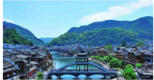
Figure 1. Fenghuang Ancient City

Fenghuang Ancient City is a famous historical and cultural city in Hengyang City, Hunan Province, which contains the regional cultural tradition in rural construction. In recent years, the performance of Fenghuang Ancient City in rural revitalization has attracted much attention and become a typical case across the country.