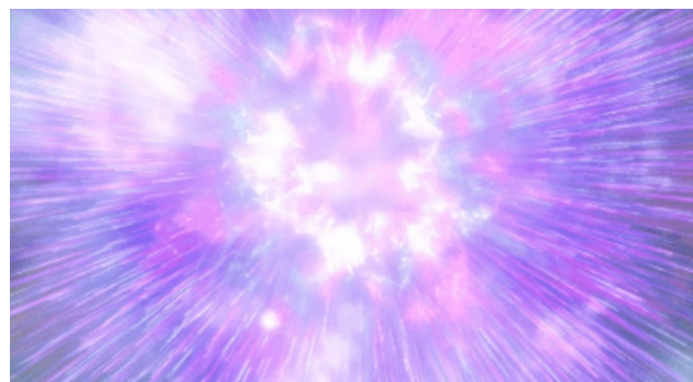
Figure 1. "The Three-body Problem" animated particle collision experiment

When the domestic sci-fi industry is faced with the "Joseph Needham" problem again, how to create Chinese-style sci-fi works and open up the domestic sci-fi market is still an unavoidable problem for many practitioners. To do an adaptation beyond the original plot itself will face the polarized debate [10]. At the beginning, the animation team of "The Three-body Problem" created a plot of Dr. Ding Yi's space experiment (as shown in Figure 1) to prove that there are more than two wise men coming to the earth. In the view of Junze, a sci-fi enthusiast, the essence of this story is to serve "showmanship", which is seriously out of touch with the main story, but in the view of some viewers, this story has a good effect and can resonate.