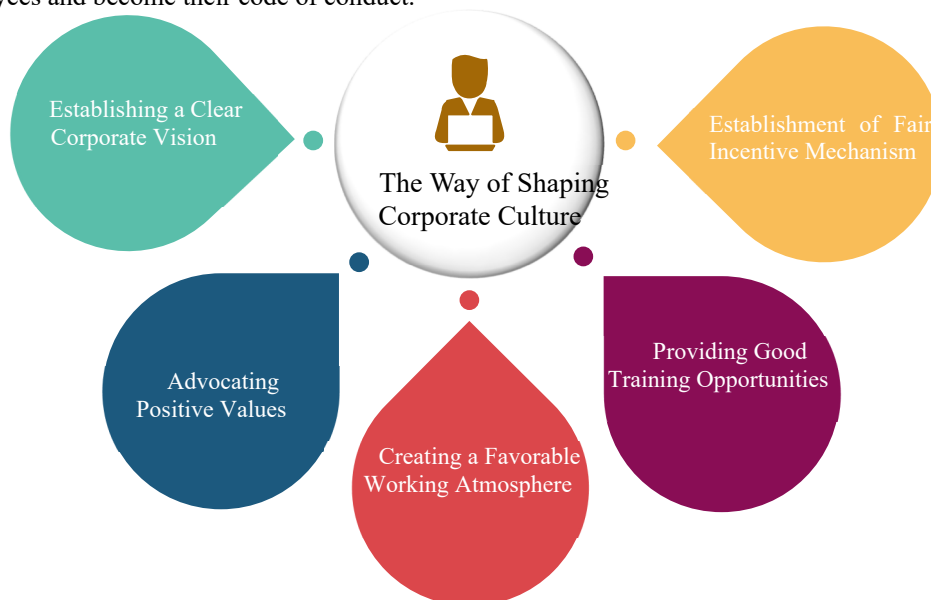
Figure 2. The Way of Shaping Corporate Culture

5) Establishment of fair incentive mechanism: Through the establishment of a fair and just incentive mechanism, make employees feel that their efforts have been duly rewarded. Through a clear system of rewards and punishments, employees are motivated to work actively, while avoiding the occurrence of unfair phenomena. Through the above measures, shaping the corporate culture in line with its own characteristics, so as to improve the loyalty of employees and job satisfaction.