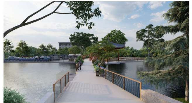
Fig 4. Rendering of the trestle

There is a small bridge in the center of the site, which is small in size. The forest stands in the water and is complemented by the trees planted above it, forming the site's. It's a great place for shade. But therein lies the problem: the trees are so tall that they prevent visitors from peering in, and the crowds of people in the cooler obstruct the view. Both sides of the pond want to walk through the swimmers, while the bridge is narrower, crowded with a long stay will inevitably be a safety hazard, for this reason, need to be To