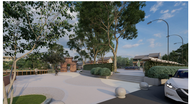
Fig 3. Rendering of the entrance

As shown in the previous section, there is only one entrance to the site, the north east gate, which needs to carry both pedestrian and vehicular traffic at the same time. The high volume of traffic also requires diversion, which makes the planning of the entrance plaza very important. The entrance plaza is the front of the site. It is one of the venues carrying the cultural bazaar and visitor center, and also the node connecting the parking lot of Qiangang Village, designed to respect the Original site elements, keeping the elements in their original positions for design, and laying streamlined paving to decorate the forward trend guide visitors' access, and appropriately arrange the tree array on the waterfront side to share the carrying pressure of the sitting area of the pond trestle, together with the waterfront A forest of sheet rock wigwams creates a unique mood of riverside mountains and forests.