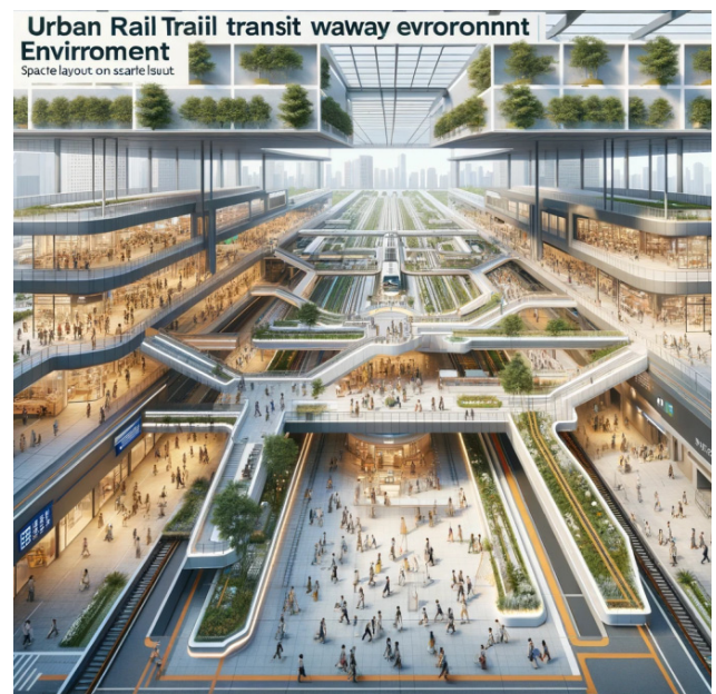
Figure 3. Layout diagram of urban rail walking space

reasonable multi-functional areas, such as business district, service area and cultural exhibition area, to improve the utilization rate and value of the space.