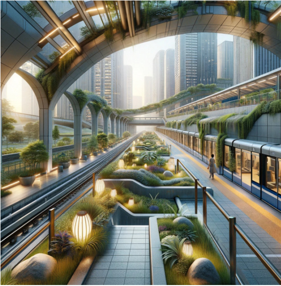
Figure 4. Landscape design diagram of urban rail walking space

taken into account, and the landscape elements in line with the urban style and cultural characteristics should be designed to improve the image of the city. Secondly, we should pay attention to the layout of greening and landscape plants, create a pleasant environment, purify the air, and improve the travel experience of passengers. At the same time, should consider the use of light and color, design appropriate lighting and decoration, improve the quality and aesthetic feeling of the space.