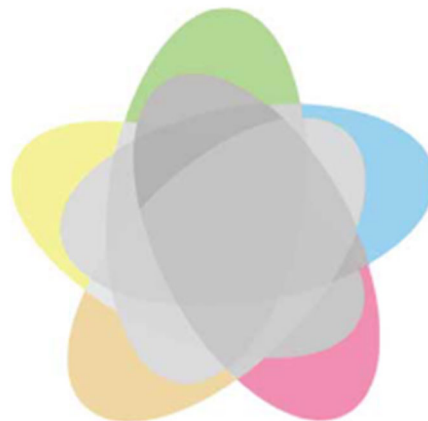
Figure 2. Complement keyword (McGlashan & Krendel, 2024)

Countries (UMICs), and “decarbonization” for High-Income Countries (HICs). This combined approach blends quantitative statistics with qualitative context checking, and also it captures both shared lexical patterns and group-specific markers. In doing so, it reveals how economic standing shapes the way that different countries talk about sustainability in global debates.