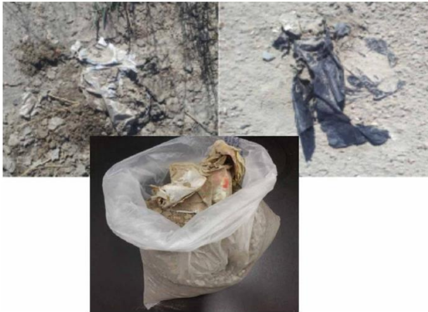
Fig. 1 Soil samples collected from farmland near the highway

The ML model uses the maximum likelihood estimation method in image classification to estimate model parameters by maximizing the likelihood function of the observed data. This approach helps us find parameter values that best describe the relationship between image features and classes, enabling accurate image classification and prediction.